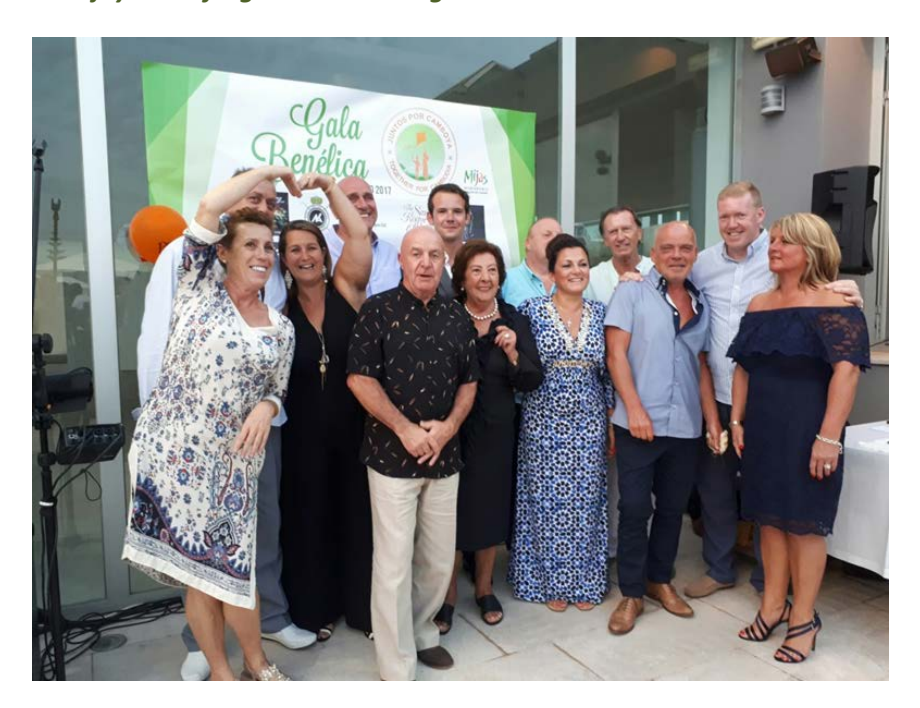
Reunions. People who had not seen each other for years and JPC re-unite.

Many THANKS to each of the PEOPLE who participated by acquiring their tickets, in some cases even acquiring Zero Row. THANK YOU for making this evening possible with your presence, your donations and your desire to enjoy an unforgettable evening. THANK YOU.